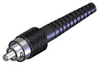
ISOMETRIC VIEW SCALE 2:3

FC/PC CONNECTOR W/ KNURLED LOCKING NUT SPRING LOADED STAINLESS STEEL FERRULE 2.0mm NARROW KEY