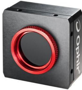
SP203P – SWIR Laser Beam Profiler

MKS Ophir has recently introduced a new model of phosphor-coated CMOS Beam Profiler – the SP203P camera. This new CMOS sensor is more advanced than the previous CCD and provides higher frame rate and improved sensitivity,