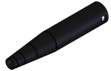
ISOMETRIC VIEW SCALE 2:1